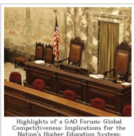
Competitiveness: Implications for the Nation's Higher Education System: GAO-07-135SP

ne U.S. Government Accountability Office FAO) is an independent agency that works for Congress. Th